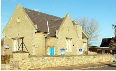
A Values School

WILLINGTON LOWER SCHOOL 'A great school in the heart of our village'