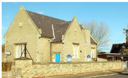
A Values School

WILLINGTON LOWER SCHOOL 'A great school in the heart of our village'